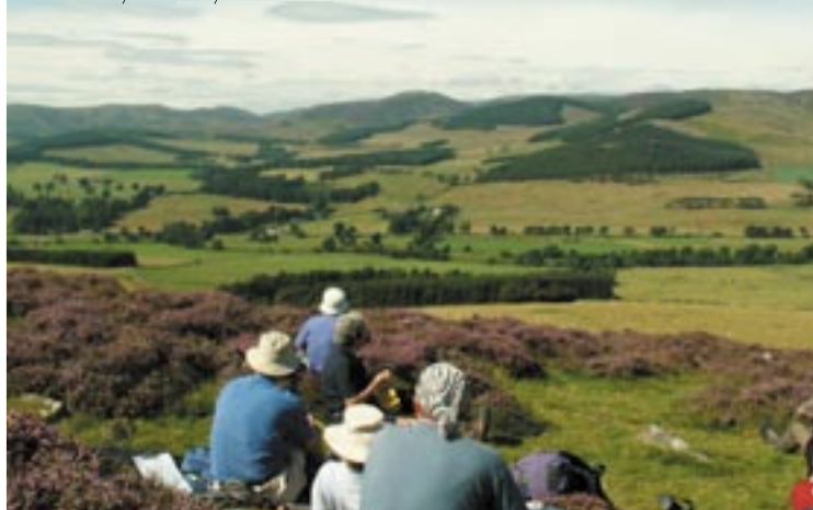
Tweed Valley at Stobo