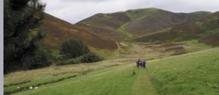
Looking up Hollows Burn to Hammer Head