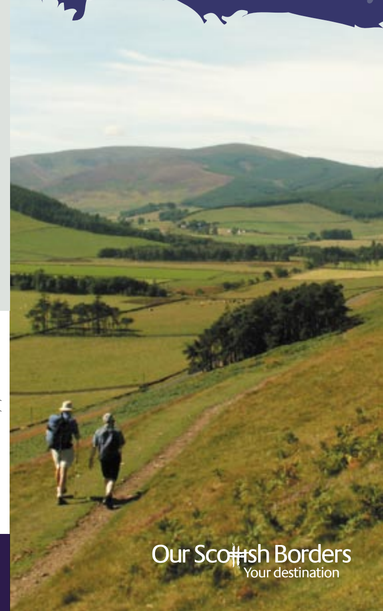
Front Cover Photo - Manor Valley by Louise Corrie

The Scottish Borders Scotland's leading short break destination