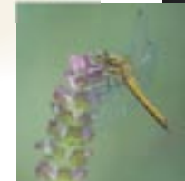
Black Darter Dragonfly